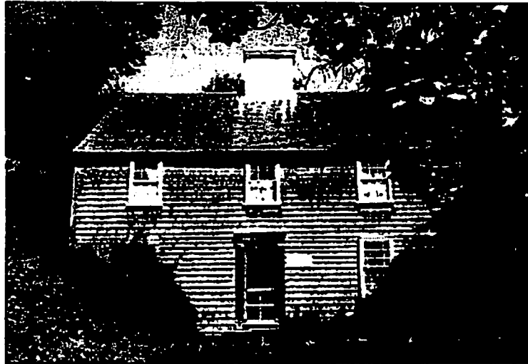
The John Alden House was built in 1653